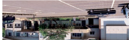
Premier Hinai Arena