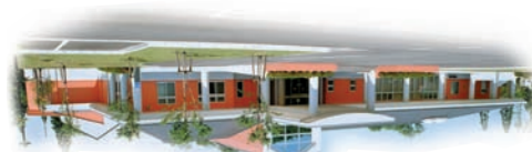
Takadate Tennis Court